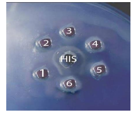
Figure2 – Result of AGPT for MDV identified in feather follicle epithelium sample: Well (1:4): Feather follicle epithelium sample collected from diseased chickens. Well (5): MDV control +ve. Well (6): Negative control sample. HIS Well: Hyper immune serum.

Also, white line of precipitation was observed within five days between prepared hyperimmune serum and 6 (37.5%) egg passage samples after 3<sup>rd</sup> passage in ECEs including 2 (50%) from feather follicle epithelium and ovary and one sample spleen.