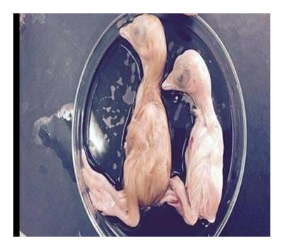
Figure 1- Egg embryo inoculated with prepared sample after 2nd passage showing stunted growth comparing with normal embryo.

White line of precipitation was observed within five days between prepared hyperimmune serum and 8 (50%) field samples including 3 (75%) samples from feather follicle epithelium (Fig. 2), 2 (50%) samples from ovary and kidney and 1(25%) sample from spleen.