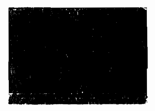
Fig. (3): Fig., (3): Group (3), liver showing mild degenerative changes in the hepatocytes. H&E., (X 400).