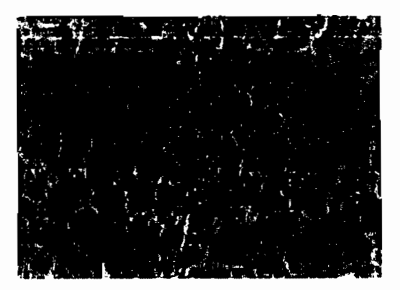
Fig. (1): Group (1), liver showing normal histological structures of hepatocytes. H & E., (X 400).